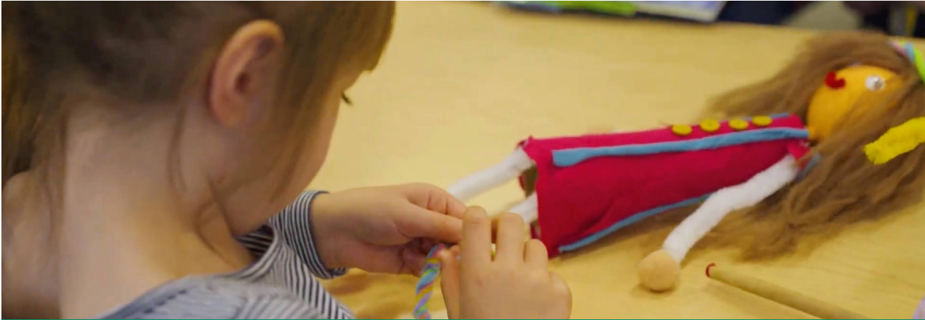
Students from Pierre-de-Coubertin Elementary School were able to put on a puppet show thanks to the Desjardins Foundation Prizes.