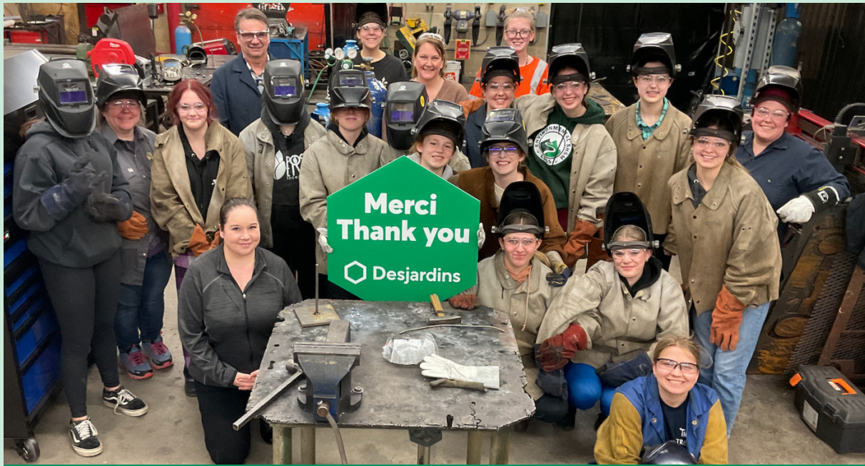
Students from the trades program at Lively District Secondary School in Sudbury received support from Desjardins.