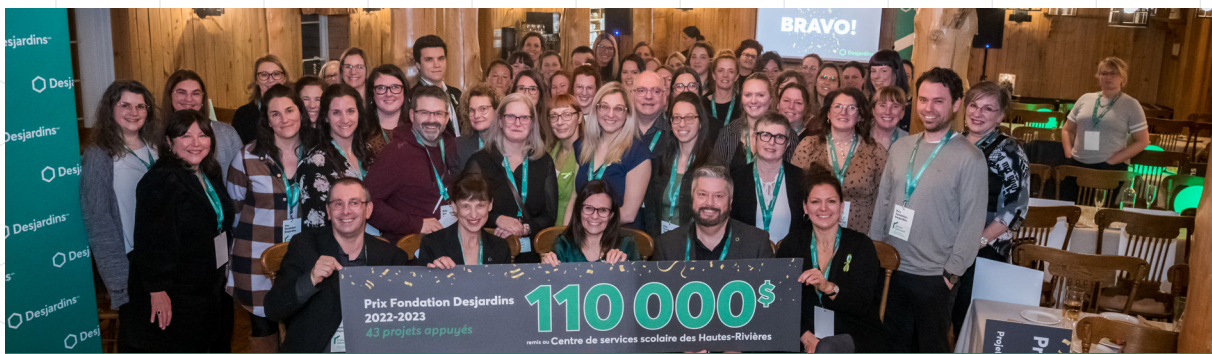
An appreciation event hosted by the Rouville and Haut-Richelieu caisses to celebrate the awarding of 43 Desjardins Foundation Prizes.

This program helps support more projects in the region. In 2023, the Desjardins Foundation and Granby caisses gave back a total of $235,000 to 91 schools and organizations.