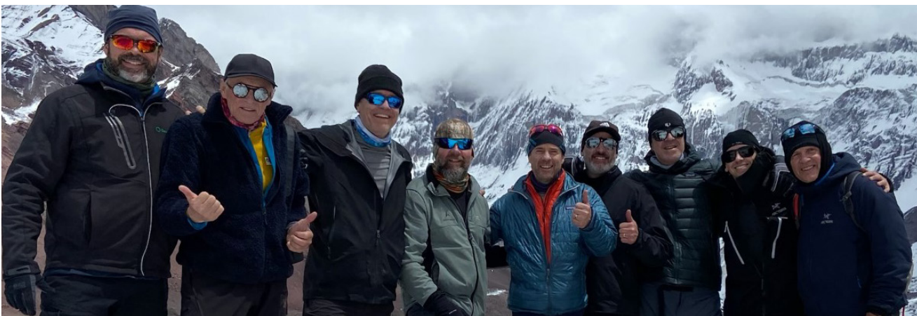
A group of Desjardins employees and retirees pushed their limits to reach the summit of Aconcagua.