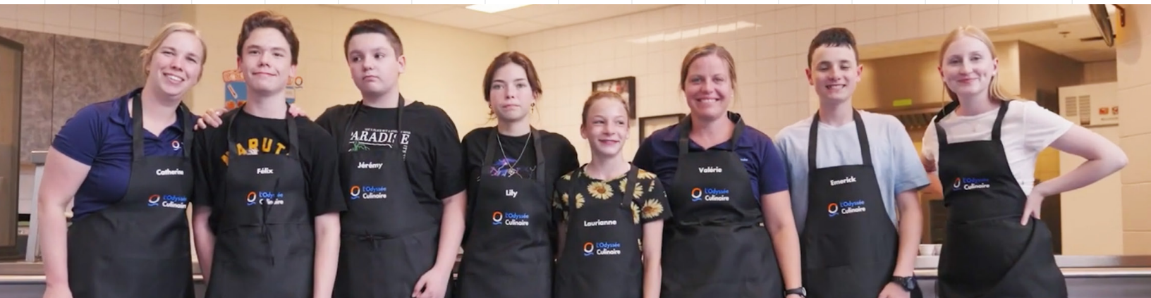
Some of the young chefs who participated in the Odyssee culinaire initiative, in Val-Bélair.

This year, a total of $1.7 million was put towards 626 initiatives that helped more than 115,500 students. Here's a look back at 3 projects carried out in 2023 that have made a real difference in the community.