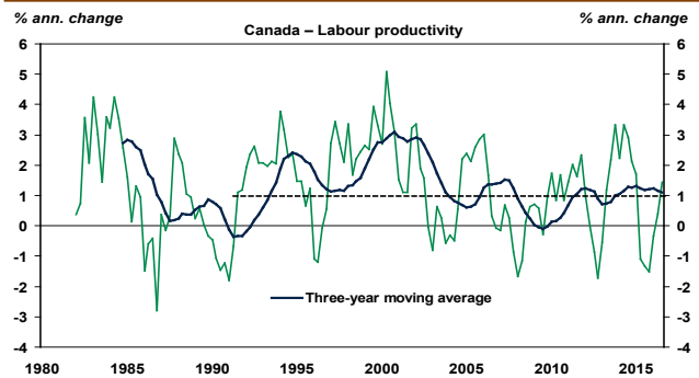
Graph 1 Productivity growth has weakened in Canada since the early 2000s