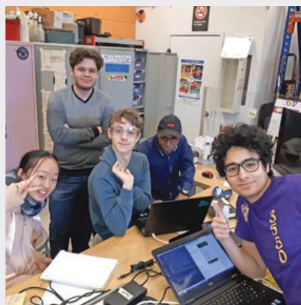
École secondaire Cavalier-De LaSalle