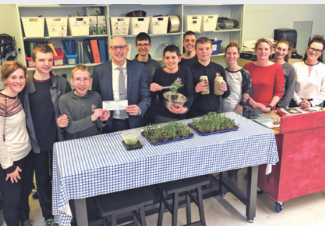
École du Triolet