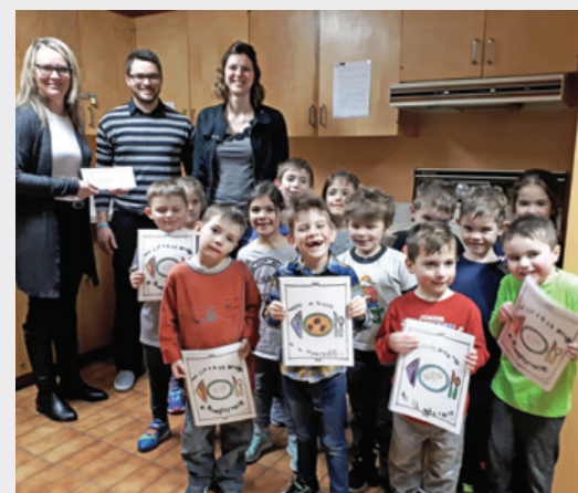
École de la Tourelle