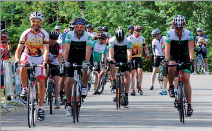
Défi Vélo Desjardins

Numerous events were held throughout the year in partnership with other organizations, regions and Desjardins Group components.