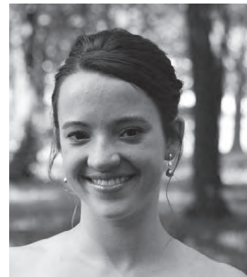
Geneviève Peel Desjardins Foundation Scholarship Recipient

This year over 2,700 applications were submitted and carefully reviewed. For the first time, applicants could apply electronically, and our personalized follow-up process provided much-appreciated support for our generous regional and national partners.